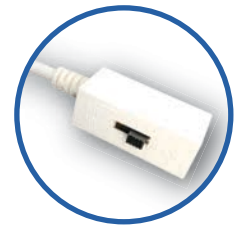
3 CCT SWITCH FOR 4"- 9"